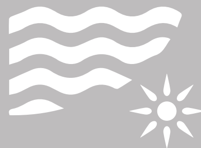
Marine Heat Wave