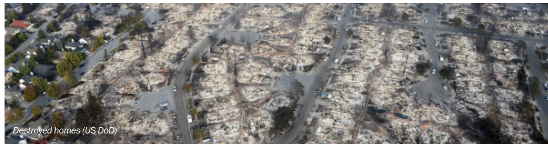
Destroyed homes (US DoD)