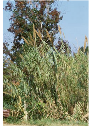
Invasive Giant Reed (Arundo Donax)