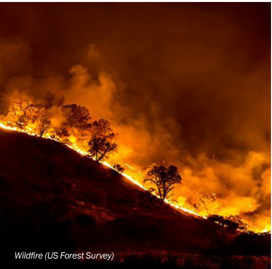
Wildfire (US Forest Survey)